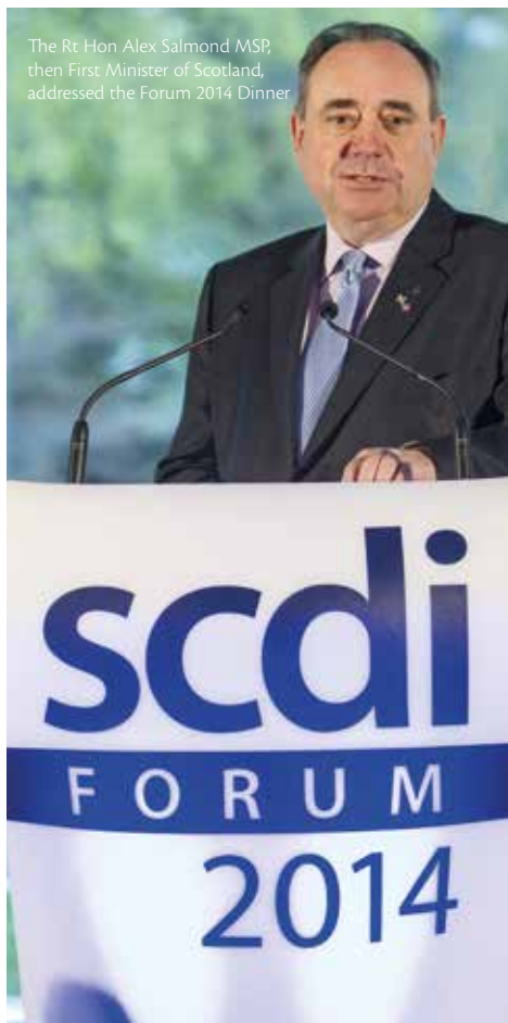
The Rt Hon Alex Salmond MSP, then First Minister of Scotland, addressed the Forum 2014 Dinner