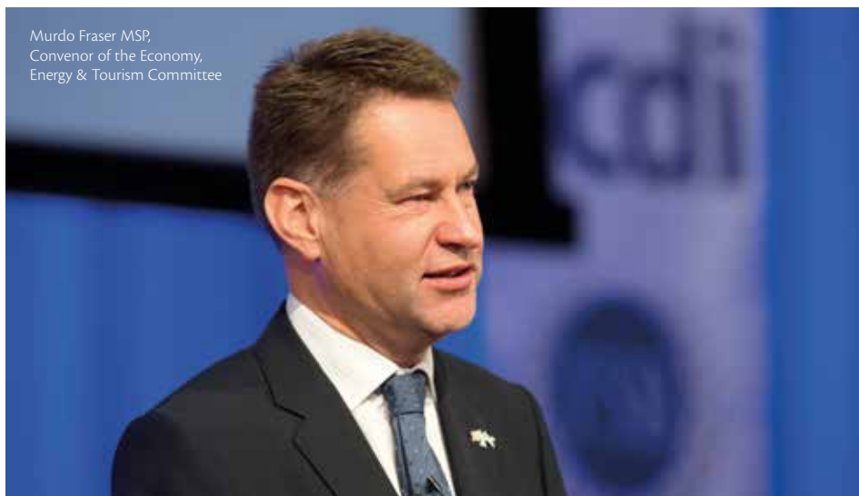
Murdo Fraser MSP, Convenor of the Economy, Energy & Tourism Committee