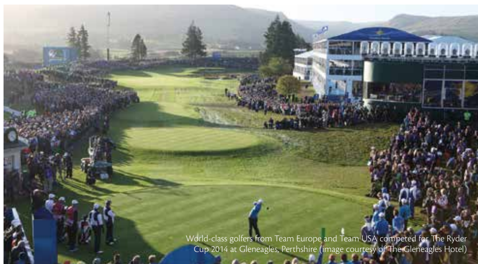
World-class golfers from Team Europe and Team USA competed for The Ryder Cup 2014 at Gleneagles, Perthshire

H elping Scottish businesses to internationalise is a core objective in SCDI's agenda for the sustainable growth of Scotland's economy. SCDI has an unrivalled track record spanning over five decades of promoting international trade, and our membership encompasses highly experienced and successful global players through to SMEs with ambitions to take their first steps into global markets.