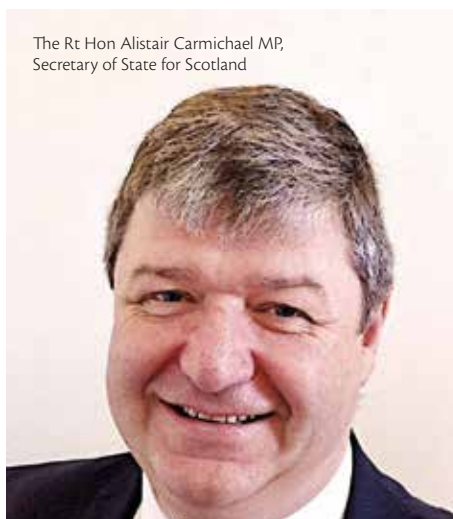
The Rt Hon Alistair Carmichael MP, Secretary of State for Scotland