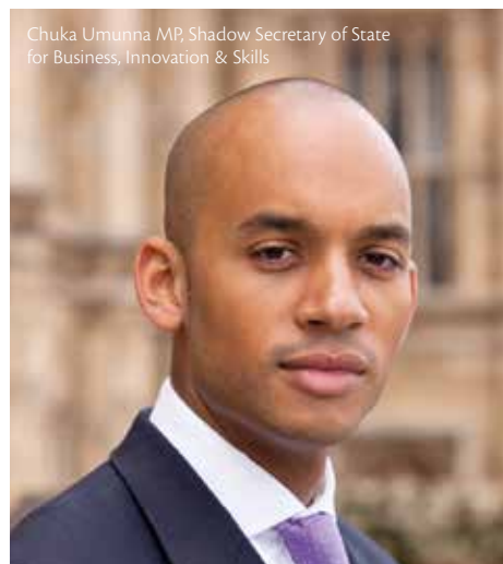
Chuka Umunna MP, Shadow Secretary of State for Business, Innovation & Skills