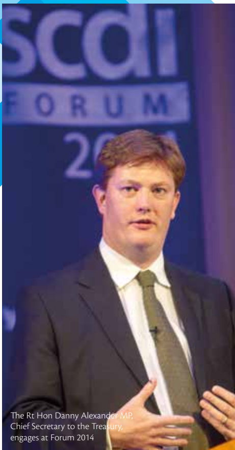
The Rt Hon Danny Alexander MP, Chief Secretary to the Treasury, engages at Forum 2014