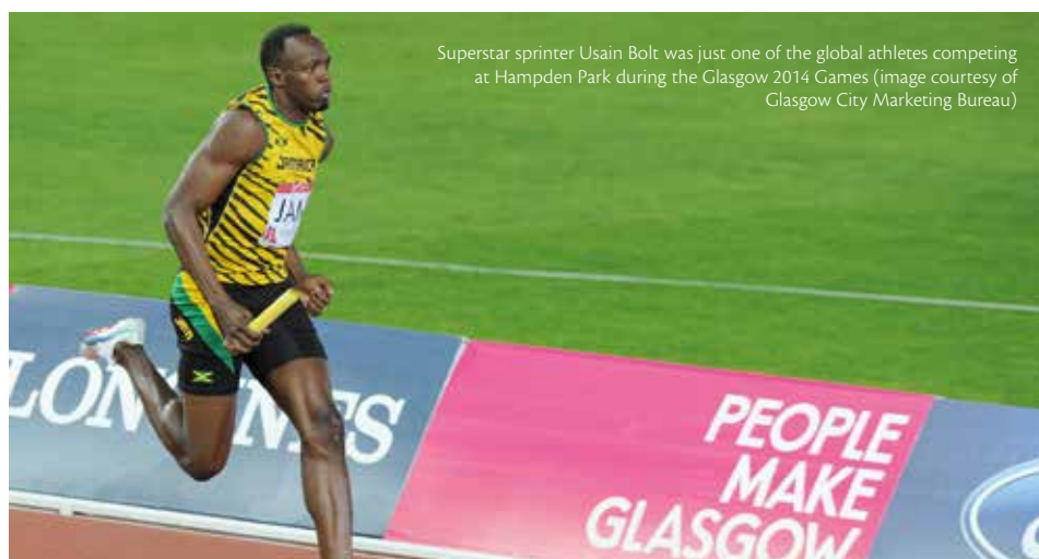
Superstar sprinter Usain Bolt was just one of the global athletes competing at Hampden Park during the Glasgow 2014 Games

SCDI contributed to the work of the Wilson Review of Support for Scottish Exporting, and gave preliminary evidence to the Scottish Parliament Economy, Energy and Tourism Committee on its Inquiry into Scottish Exports. SCDI has engaged with UKTI through the year in opportunities to deliver projects to exporters. We also worked in partnership on a range of events from a China Business Breakfast organised by SCDI at University of Glasgow, to events with Enterprise Ireland and Hong Kong Trade Development Council.