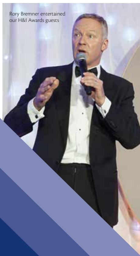
Rory Bremner entertained our H&I Awards guests