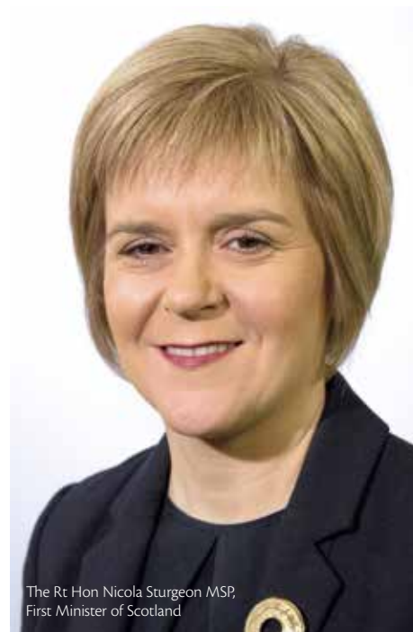
The Rt Hon Nicola Sturgeon MSP, First Minister of Scotland

Our Influencers' Dinner series continued across Scotland, bringing together business and civic leaders to provide a forum for expert insights and opportunity for a deeper dialogue and exchange of views with members.