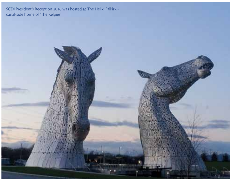
SCDI President's Reception 2016 was hosted at The Helix, Falkirk - canal-side home of 'The Kelpies'