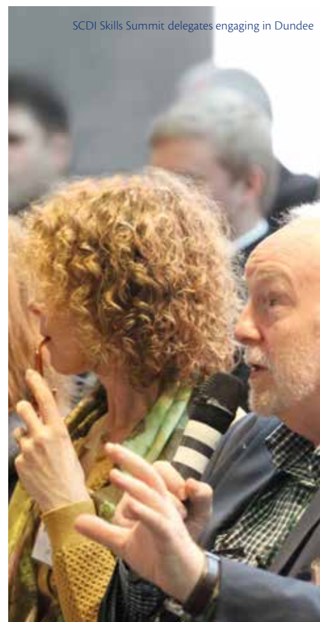
SCDI Skills Summit delegates engaging in Dundee