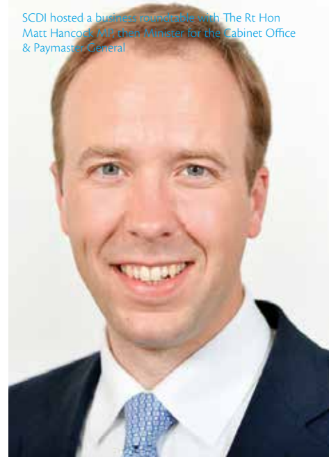
SCDI hosted a business roundtable with The Rt Hon Matt Hancock MP then Minister for the Cabinet Office & Paymaster-General

During the post-Referendum period and Brexit process, SCDI will continue to work hard to understand the implications for businesses and organisations in Scotland. We will continue to seek the views of our members, across all sectors and in all geographies, to ensure that these continue to be communicated to both the Scottish & UK Governments as we work with them together for the Scottish economy.