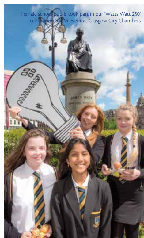
Female school pupils took part in our 'Watts Watt 250' celebration STEM event at Glasgow City Chambers

YESC is kindly supported and funded by a number of industry Partners who enable us to continue to inspire pupils across Scottish schools through engaging with STEM projects. During the year, our Lead Partners of YESC were: Shell U.K. Limited, The Scottish Government and Skills Development Scotland. Our Principal Partners were BAE Systems, BP plc, BT Scotland, Chevron, Morrison Construction, OPITO, TAQA Bratani Ltd, Tomorrow's Engineers and Wood Group.