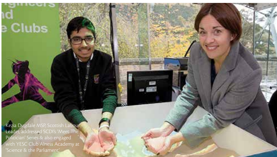
Kezia Dugdale MSP, Scottish Labour Leader, addressed SCDI's 'Meet The Politician' Series & also engaged with YESC Club Ainess Academy at 'Science & the Parliament'

A key feature of our annual SCDI Forum is political engagement with government and we are delighted that in 2016 - in a first for Scotland - both the First Minister Nicola Sturgeon MSP and The Secretary of State for Scotland David Mundell MP jointly appeared on our common economic platform at the Forum 2016 Dinner held in March in St.Andrews.