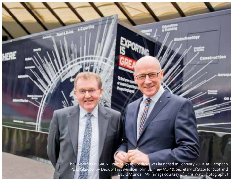
The 'Exporting is GREAT' campaign in Scotland was launched in February 20-16 at Hampden Park Glasgow by Deputy First Minister John Swinney MSP & Secretary of State for Scotland David Mundell MP

Launched UK-wide in November 2015 in Gateshead, and with its Scottish launch taking place in February 2016 at Hampden Park, Glasgow with both the Deputy First Minister John Swinney MSP and the Secretary of State for Scotland David Mundell MP , Exporting is GREAT is part of the GREAT campaign. Research demonstrates that exporters - of all sizes - are more productive, innovative and resilient to economic downturns. As the world becomes ever more globalised and digital, the potential for Scottish businesses to reach out to new customers and lucrative new international markets has never been greater. Exporting is GREAT showcases live export opportunities, and provides advice and support to help your business begin exporting from initial interest to selling in market. Every day around the world, someone somewhere wants or needs your products or services. Hundreds of live export opportunities are being made available on an ongoing basis at www.exportingisgreat.gov.uk