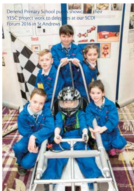
Denend Primary School pupils showcase their YESC project work to delegates at our SCDI Forum 2016 in St Andrews

Dr Alasdair Allan MSP, (then) Minister for Learning, Science & Scotland's Languages, The Scottish Government