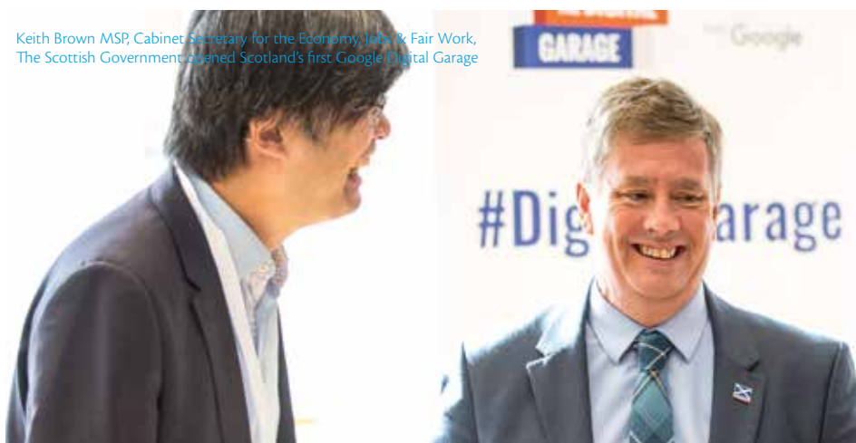
Keith Brown MSP, Cabinet Secretary for the Economy, Jobs & Fair Work, The Scottish Government opened Scotland's first Google Digital Garage