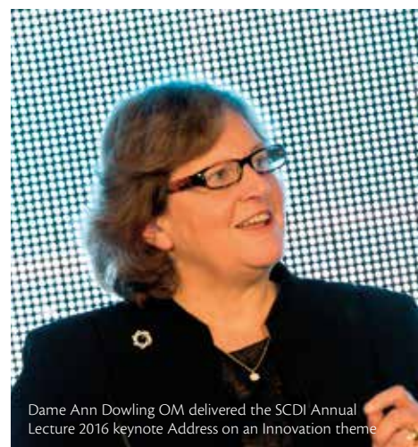
Dame Ann Dowling OM delivered the SCDI Annual Lecture 2016 keynote Address on an Innovation theme

Prior to delivering her Lecture, Dame Ann Dowling engaged with local secondary school pupils when she visited the nearby Dyce Academy, who showcased their developing STEM-related (Science, Technology, Engineering & Maths) skills through their ongoing work as one of over 1,400 SCDI YESC (Young Engineers & Science Clubs Scotland) Clubs throughout all 32 Local Authority areas.