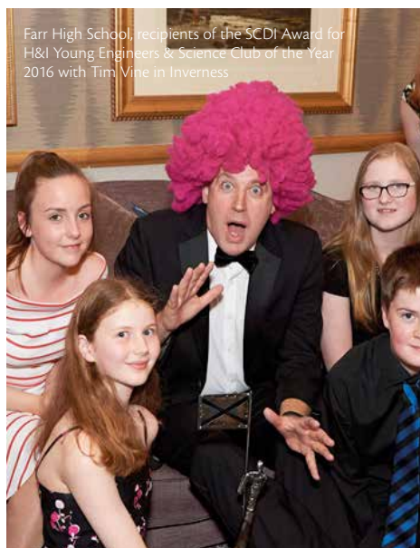
Farr High School, recipients of the SCDI Award for H&I Young Engineers & Science Club of the Year 2016 with Tim Vine in Inverness

Scotland offers huge potential to international investors and the Alliance has great ambitions for Scotland's city economies which are high quality locations in which to do business. With a Pitch Book showcasing £7.5 billion of exciting investor-ready opportunities across the seven cities, the Alliance aims to attract external investment, stimulate economic activity and create business growth.