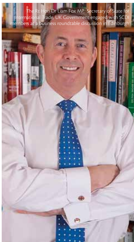
The Rt Hon Dr Liam Fox MP, Secretary of State for International Trade, UK Government engaged with SCDI members at a business roundtable discussion in Edinburgh