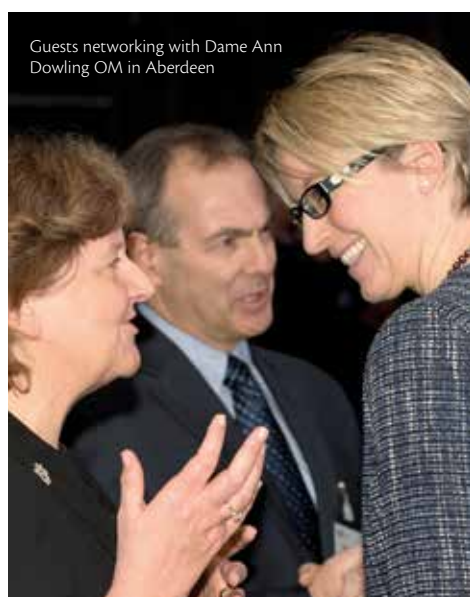
Guests networking with Dame Ann Dowling OM in Aberdeen

In addition to its established programmes in the North of Scotland, SCDI has strengthened links with key stakeholders in a number of regional economies throughout the year to consolidate and further develop its regional development activities. City Region Deals being developed across all of Scotland are proving a key economic driver and are strongly welcomed by SCDI.